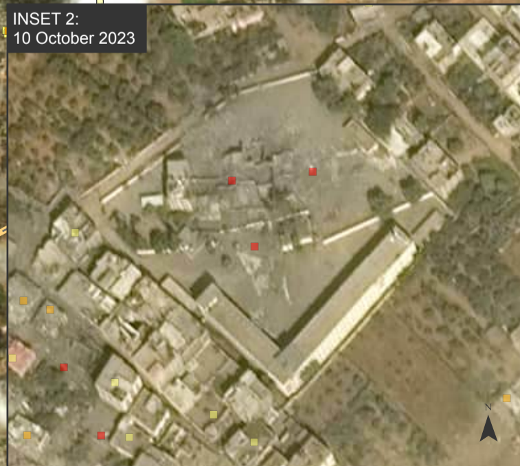
INSET 2: 10 October 2023

Spatial Reference Name: WGS 1984 UTM Zone 36N PCS: WGS 1984 UTM Zone 36N GCS: GCS WGS 1984 Datum: WGS 1984