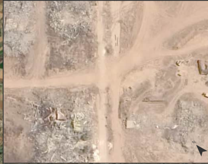
INSET 2: Impact crater on Al Rashid (coastal) Road, Deir al-Balah Governorate. 29 May 2024