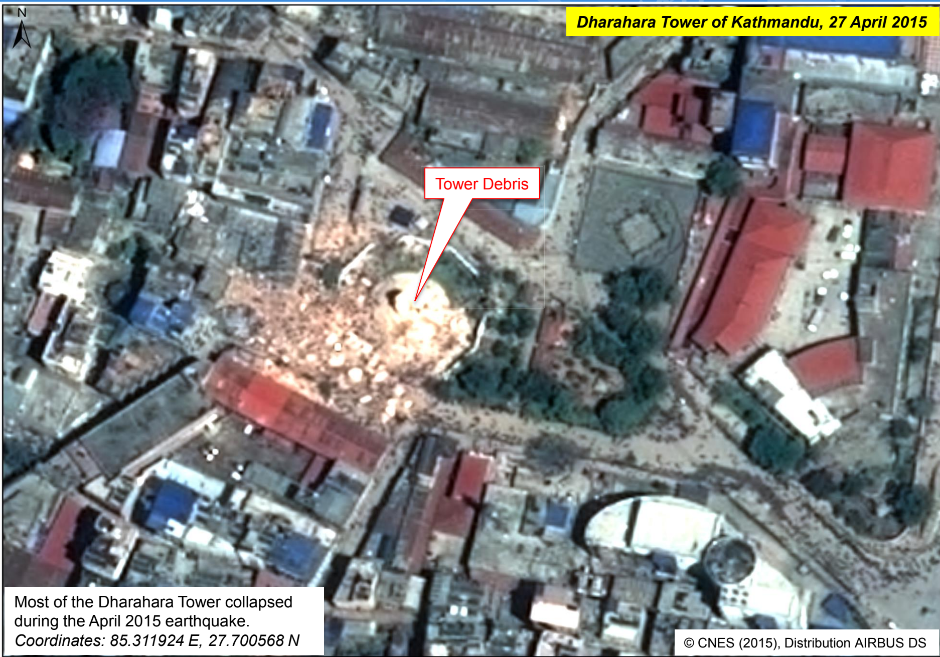
Most of the Dharahara Tower collapsed during the April 2015 earthquake. Coordinates: 85.311924 E, 27.700568 N