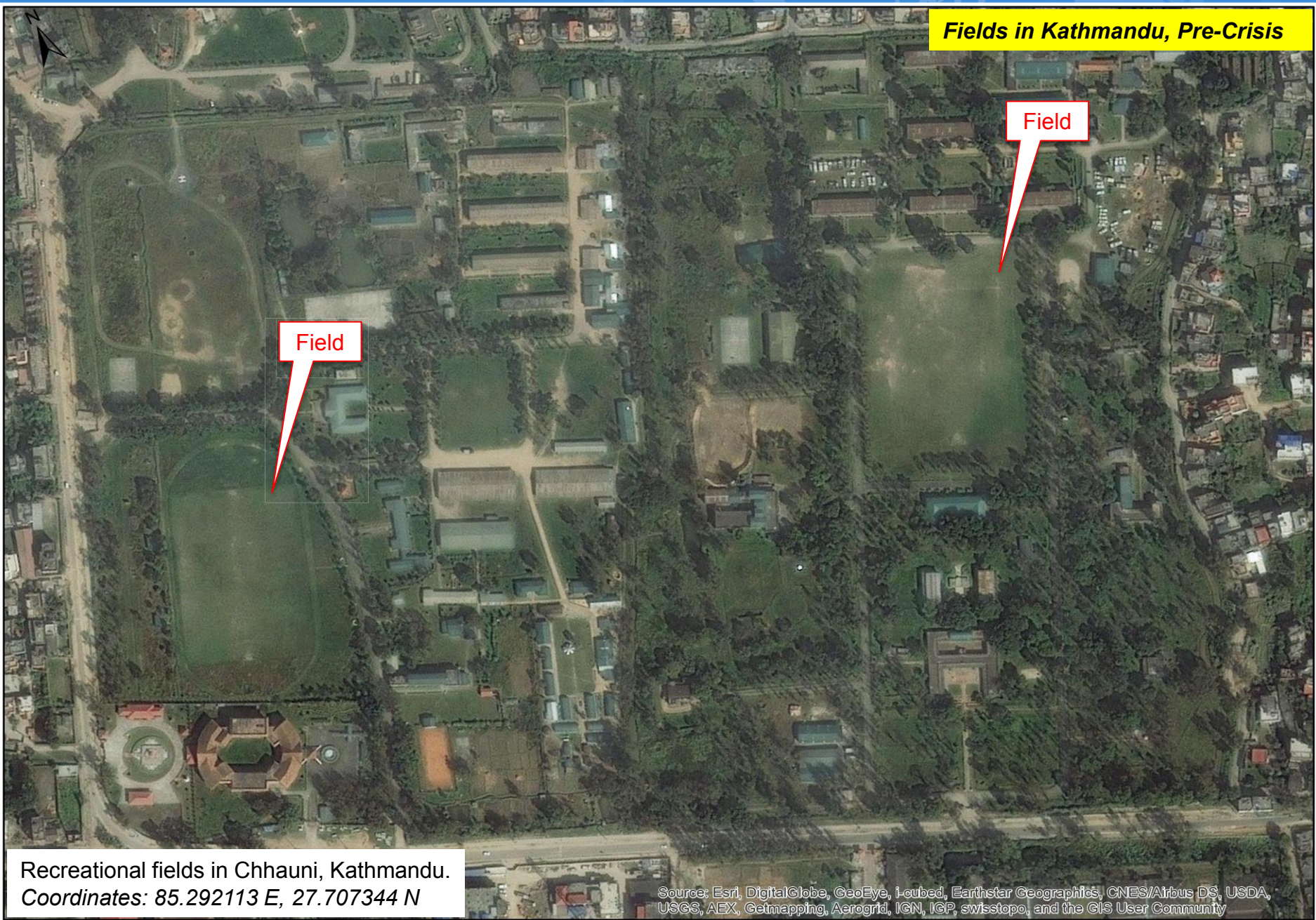
Recreational fields in Chhauni, Kathmandu. Coordinates: 85.292113 E, 27.707344 N

Source: Esri, DigitalGlobe, GeoEye, I-cubed, Earthstar Geographics, CNES/Airbus DS, USDA, USGS, AEX, Getmapping, Aerogrid, IGN, IGP, swisstopo, and the GIS User Community